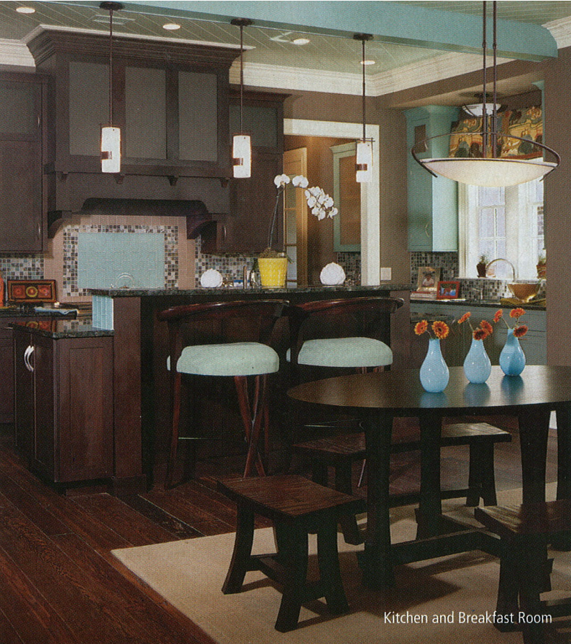
Kitchen and Breakfast Room

GREAT IDEA: A simple door style keeps the kitchen cabinets looking clean and uncomplicated, while a mix of stained and painted finishes stirs up plenty of visual interest. Both the center island and the cooktop wall hold cabinets that are stained espresso. Cabinetwork on the side walls repeats the blue-green of the ceiling beams. Stainless steel appliances shine beside the rich cabinetry.